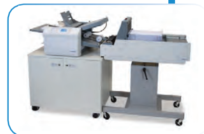
FD 38X in-line with optional V-Stack36 Vertical Stacker, stand and cabinet

WWW.WHITAKERBROTHERS.COM 3 TAFT COURT ROCKVILLE, MD 20850 800-243-9226