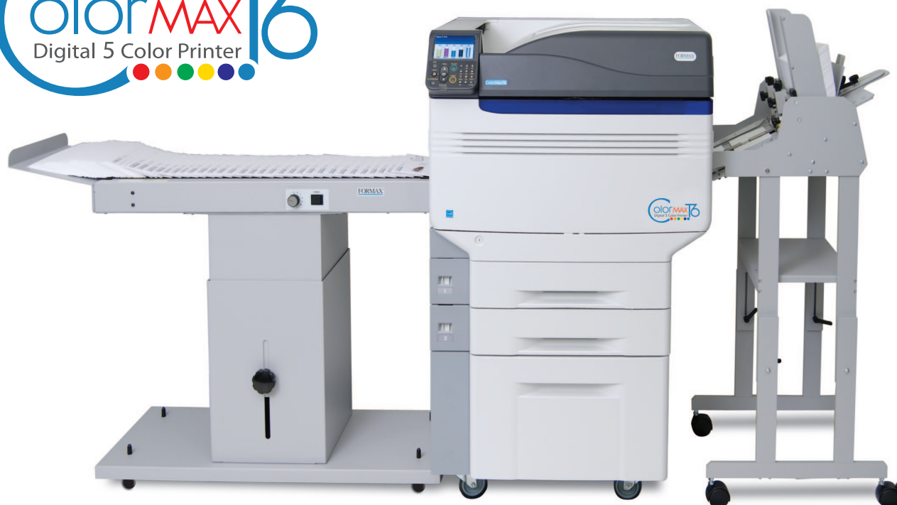
ColorMaxT6 System: Digital 5+ Color Printer, Output Conveyor and Envelope Feeder